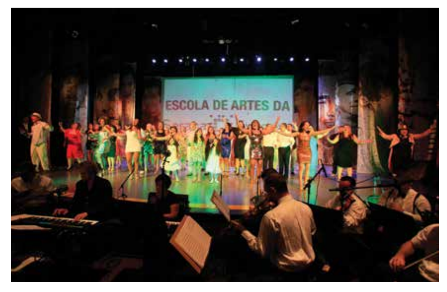
This production by Serasa's School of Arts and Music is one of many activities that bring employees together outside of work.

The true scale of the financial crisis only became evident in 2008. Banks were facing a rising tide of defaults and many of them went under. Governments were forced to act and take control of the banking system. The world economy was shaken. Several investors thought Experian would go the