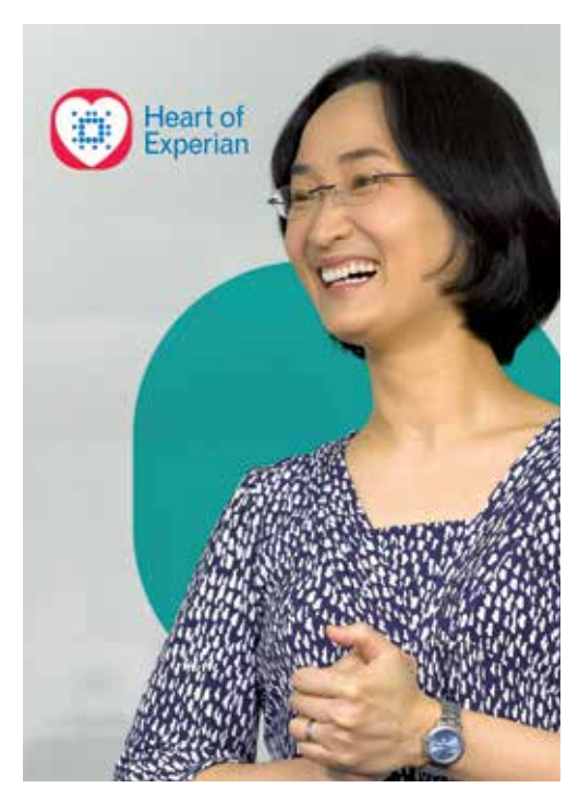
Heart of Experian used employee stories to bring to life the ideas embodied in 'Connect'. 'Protect' and 'Create'.

Experian is a business today with nearly $5bn in revenue. Nearly two thirds of revenues come from outside the financial services sector and its operations span the globe. The company is in a lot of growing economies and in some exciting growth sectors, and it remains firmly a business of the future. The prospects for Experian and its people appear as exciting now, and perhaps just as challenging, as they were in those earliest pioneering days.