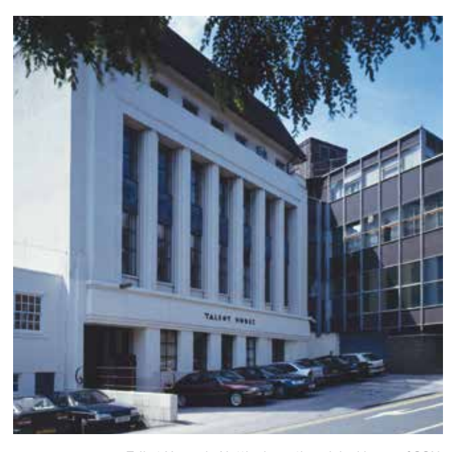
Talbot House in Nottingham, the original home of CCN.