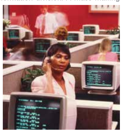
TRW's involvement with the US credit industry spanned three decades, during which time American consumers came to regard 'a TRW' as the generic term for a personal credit report.

The division's multi-faceted growth strategy focused on developing new services for clients, cultivating the consumer market, expanding the affiliate network and continuing to invest in new technology.