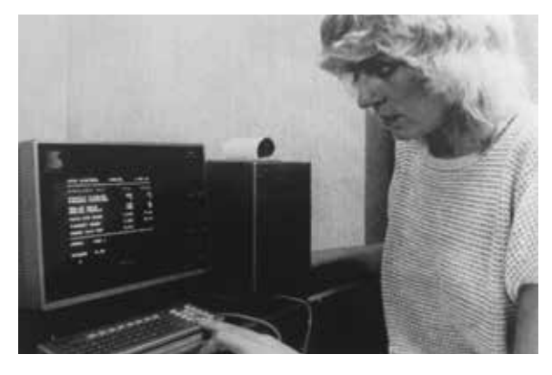
Innovator and thought leader

in the public domain and then persuading clients to submit their own data. Client confidentiality was absolute and CCN earned the respect of mail order companies, retailers, banks, building societies and insurance companies.