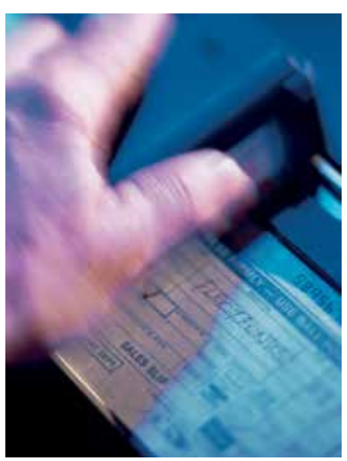
The average household credit balance increased fivefold during the 1980s.