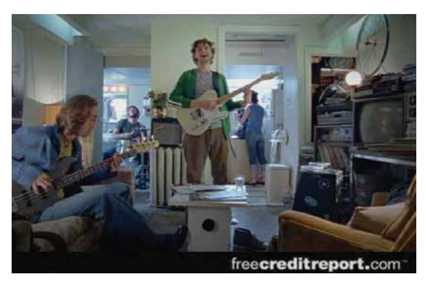
Television advertising proved highly effective in building awareness of Experian's services to consumers.

time, just as the internet went through a tremendous growth cycle, which no one could have fully anticipated. Later acquisitions of internet businesses proved less successful, in part because there was no natural fit with the rest of Experian. In time, it became a lesson that success stemmed not from the internet itself, but from tying in acquisitions to Experian's particular expertise in data and analytics.