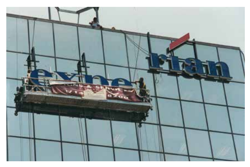
The headquarters of TRW IS&S in Orange County, California, were rebranded Experian following the sale of the business to private equity investors.

One condition of the sale was that the business should no longer trade under the TRW name. A search began for a new name that would carry the right image. Consultants in New York came up with a long list of suggestions that included Actua, Cogneo, Factbase, Fidelta, Informedia, Knosis, Newlight and Trustin . The final shortlist came down to two – Experian and Signifact. On 17 July 1996, the new name was announced; the company was to be called Experian.