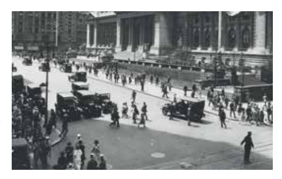
The motor car was an essential part of the American Dream and, for many, could only be afforded on credit.

By the 1920s, more than 20 per cent of purchases made in US department stores were on credit. Motor cars were also growing in popularity and were often bought on credit. There were now more than 1,000 credit agencies located all over the