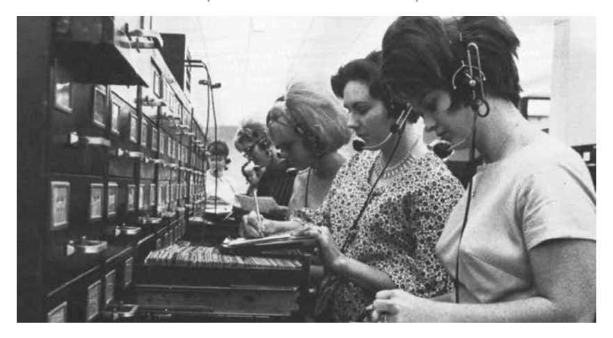
Telephone operators at a US credit agency in the 1960s search for credit information from index cards in response to requests from subscribing merchants.

In the 1920s, the telephone was almost as great an innovation as the computer half a century later. Merchants could now call an agency and ask for a customer's credit report to be read out over the phone.