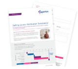
Create your notification templates

This important step ensures you have a notification template in place with your branding and draft content. Ensuring you can quickly review in the event of an incident.