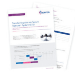
Transfer personally identifiable information (PII) securely

To enable safe and secure transfer of PII data we have set up this guide to provide key information for you.