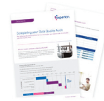
Validate your contact data

Storage of your plan and assets in readiness for a data breach incident.