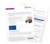
Prepare key Contact Centre Frequently Asked Questions (FAQs)

Choosing FAQs in advance means you can just add the more specific scenario questions when a live incident happens, saving you time.